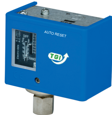
COMMERCIAL PRESSURE SWITCH, TGI43-1